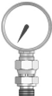
Pressure Gauge fitted with adaptor