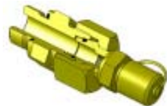
For connection of Diagnostic Coupling

For technical details, Contact sales@hyloc.co.in