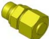
For Blanking of 24° Cone