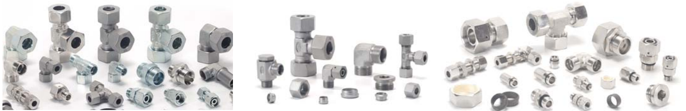
ISO 8434 / DIN 2353 Hydraulic tube couplings